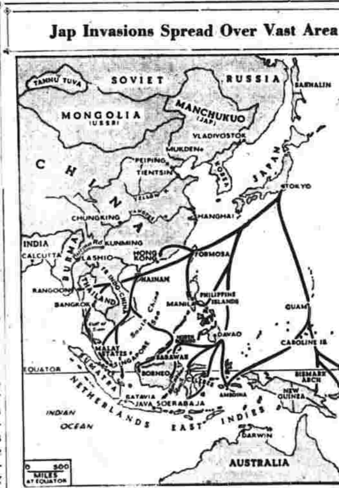
Jap Invasions Spread Over Vast Area